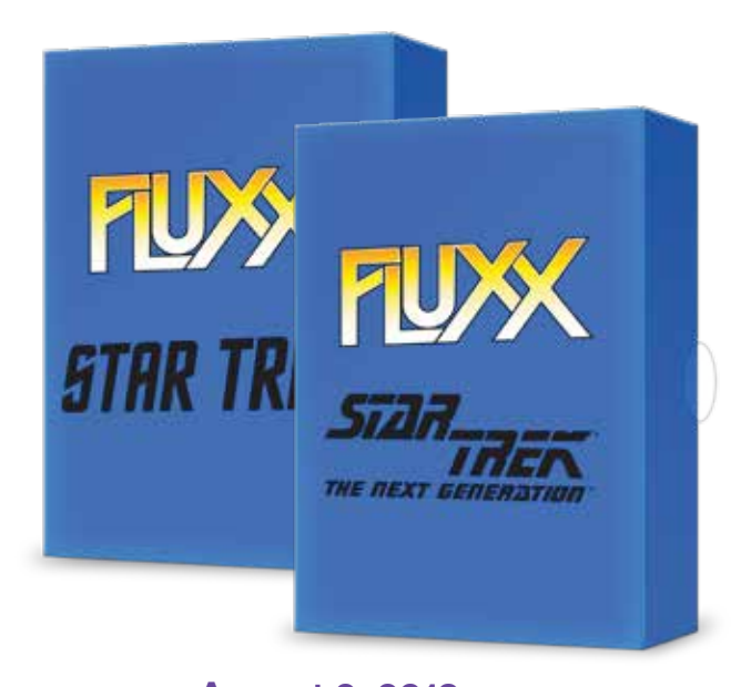
August 2, 2018