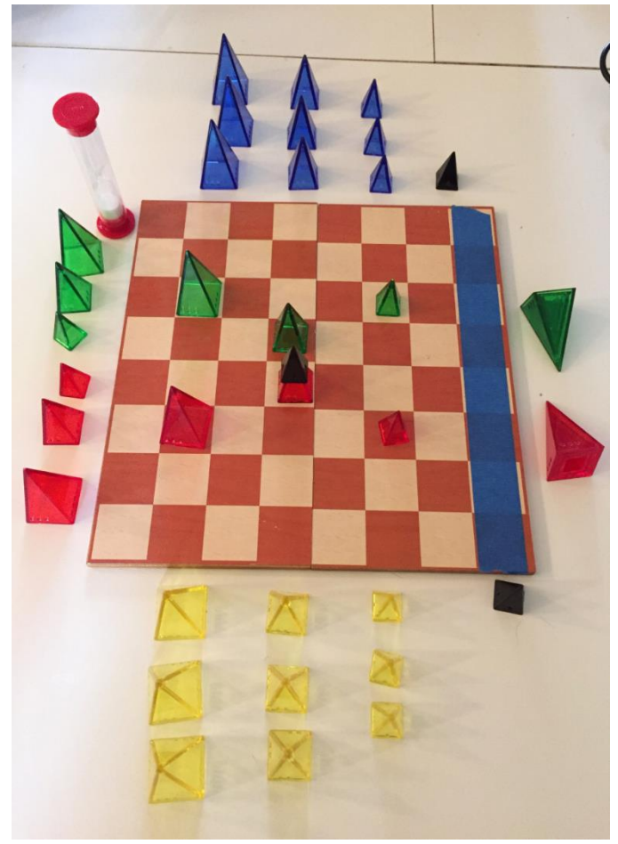
Example setup. Note: player screens are not shown.